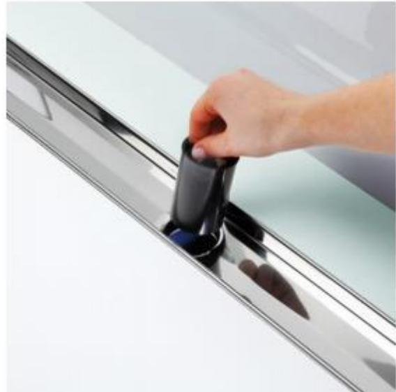
To rinse the siphon, remove the anti-odor tube

Simply remove the anti-odor tube from the body of the siphon and rinse the "self-cleaning" waste with water from the shower head. Do not use any aggressive or abrasive cleaning agents to clean the gutter body, as they could damage the surface of the 1.4301 stainless steel (AISI 304).