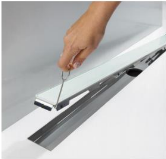
Lift the cover with a key (included in the delivery package)

If the drain pipe becomes clogged, the pipe can be cleaned with a small manual cleaning spiral. The mark inside the siphon indicates the direction of the outflow.