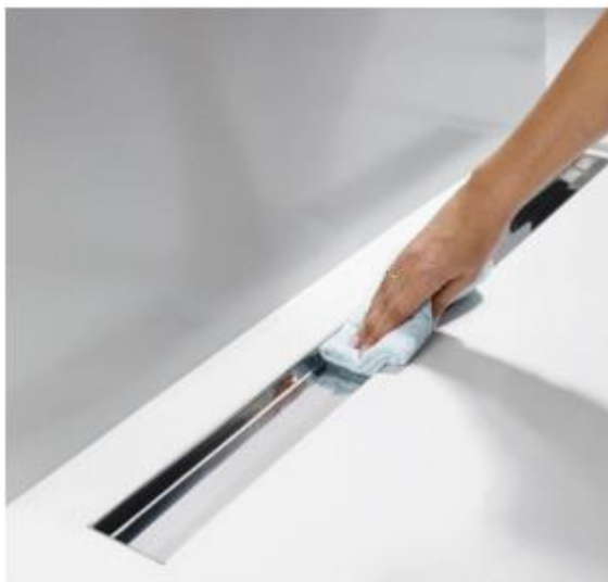
Clean the body of the gutter with a soft cloth - do not use aggressive or abrasive cleaning agents